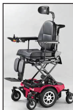
Seat elevator travel range: 30cm/12inch