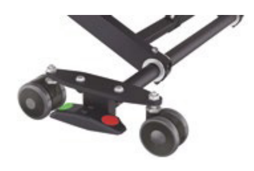
UNISAFE™ BRAKING SYSTEM