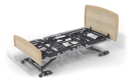
1050mm WIDTH ADJUSTMENT