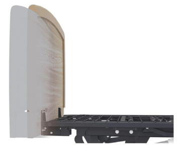
BUILT-IN LENGTH EXTENSION