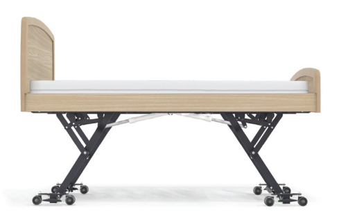
FULL NURSING HEIGHT 800mm