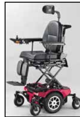
Seat elevator travel range: 30cm/12inch