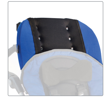
Headrest Extension Curved - Cordura