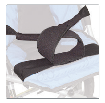
Lateral Thigh Support (Adductor)