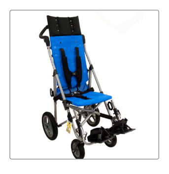
Heavy Duty Reinforced Upholstery - Textiene