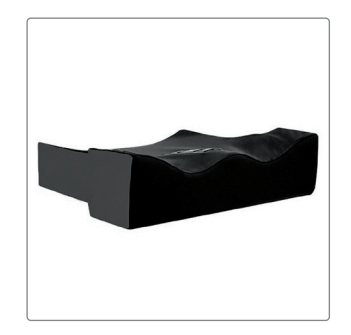
Align Cushion - Lateral Pelvis/Lateral Thigh Support*1