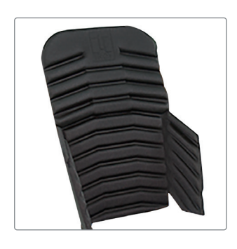
Seat Reducer Insert