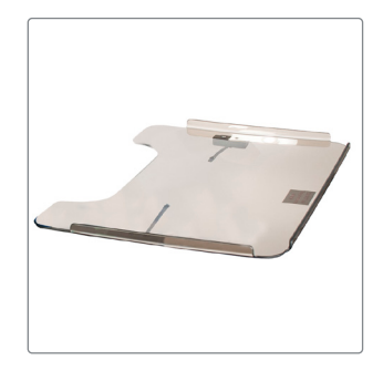
Upper Extremity Support Surface (Clear Tray)