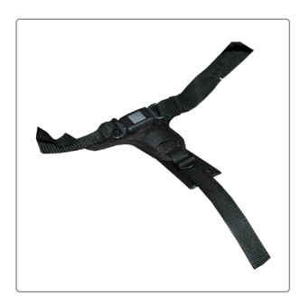
3-Point Positioning Belt