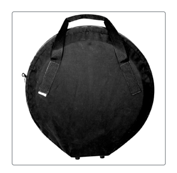
Travel Bag for Convertible Wheels