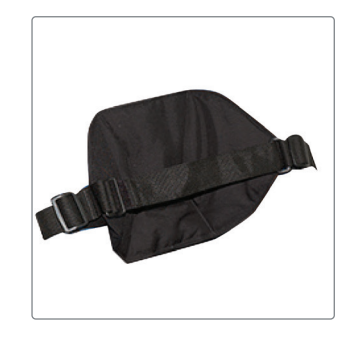
Soft Adjustable Lateral Support Single Flap w/ Scoli Strap