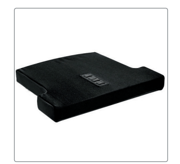
General Use Cushion*¹ (Not available in EU)