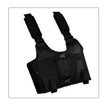
Full Torso Support Vest