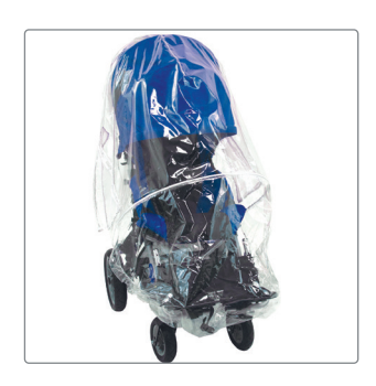
Rain Cover Canopy Required