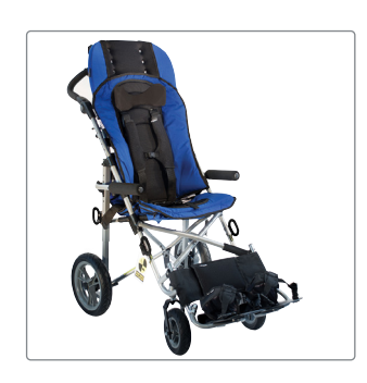
Heavy Duty Reinforced Upholstery - Cordura