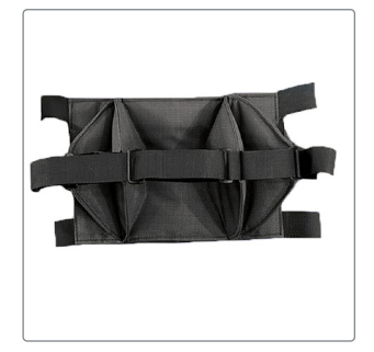
Soft Adjustable Lateral Support Double Flap w/ Scoli Strap