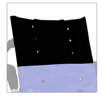
Headrest Extension Rectangular - Textiene (Not available in EU)