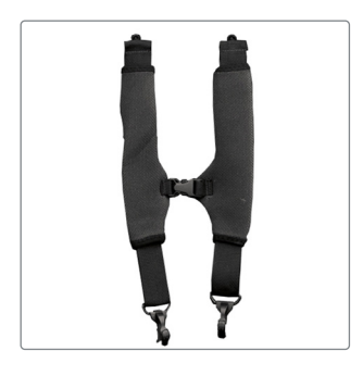
H-Harness with padded covers 3-Point Positioning Belt Required