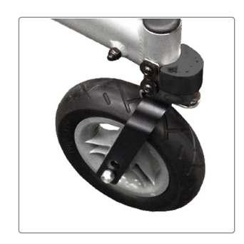
Castor Locks (Standard in EU)