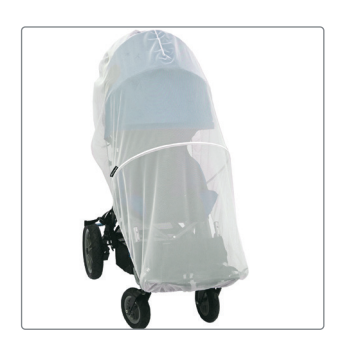
Mosquito Net Canopy Required