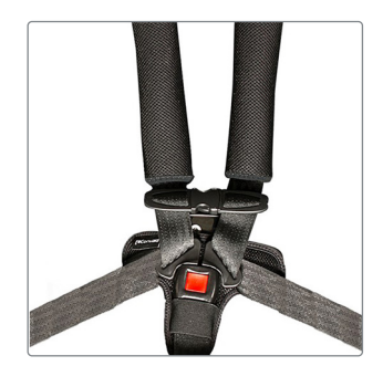
5-Point Harness with Padded Covers (EZ 12 only)* Crash Tested, WC19 Compliant