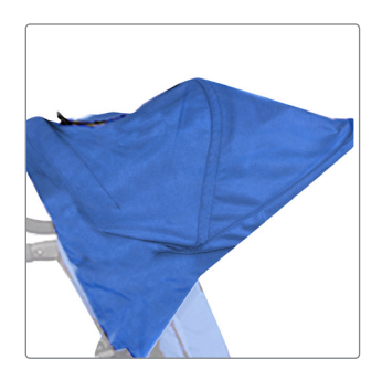
Headrest Cover (Canopy)