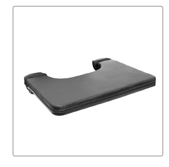
Upper Extremity Support Surface (Foam Tray)^