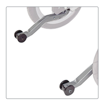
Rear Anti-Tip Tubes (Pair)