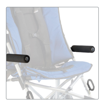
Height Adjustable Flip-up Armrests