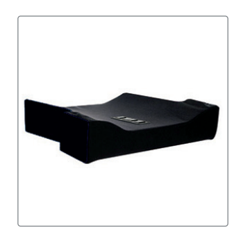
Position Cushion -Medial Thigh Support/ Anti Thrust*1