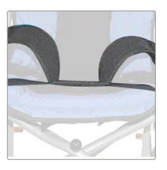
Medial Thigh Support (Abductor)