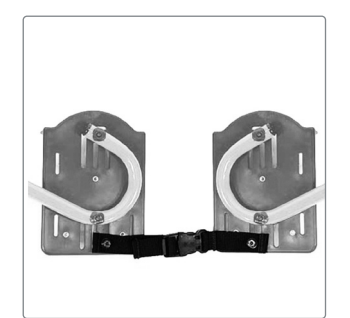
Footplate Securement Strap