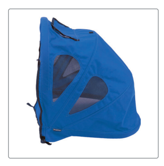
Extended Headrest Cover w/ and without windows (Canopy)