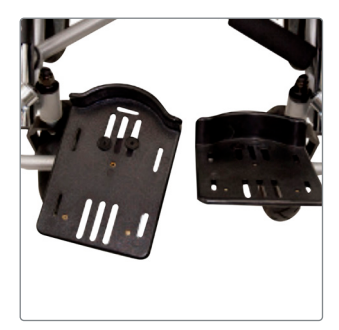
Individual Angle Adjustable Footplates