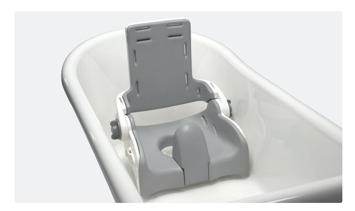
Suction cups fitting to bath (R82 Orca)

Our Flamingo family is one of the most versatile products on the market with up to five configurations available. It can be used freestanding with a pan, directly over the toilet, as a shower chair and as a potty chair. The seat is also removable for direct mounting on a toilet or in a bath.