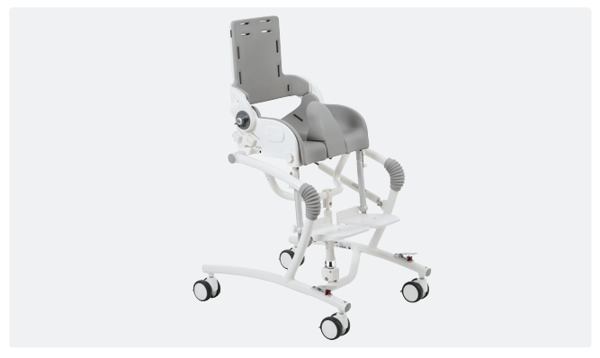
Flamingo high-low frame