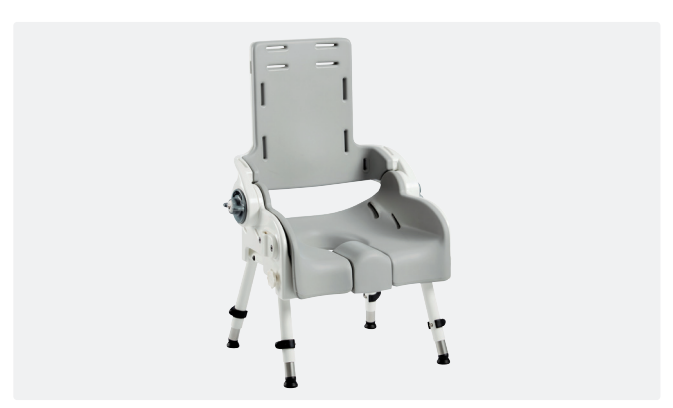
Potty frame adaption