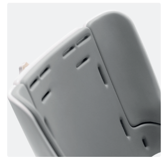
Sides with upholstery