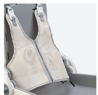
Vests and belts