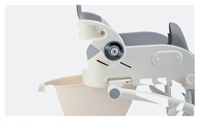
Use with a commode pan