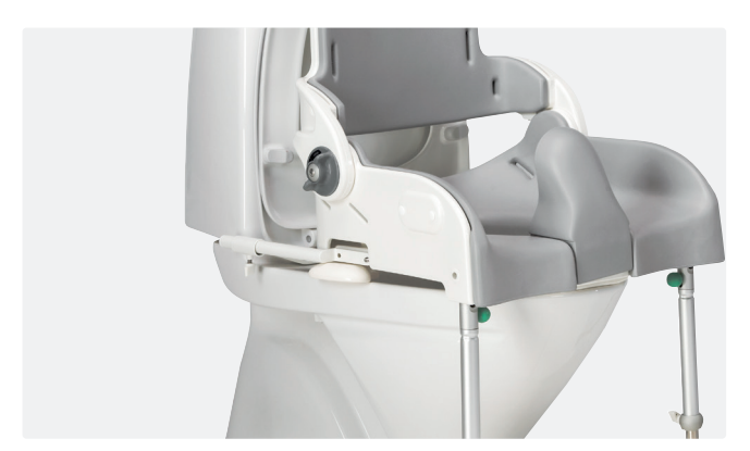
Direct fitting to the toilet seat