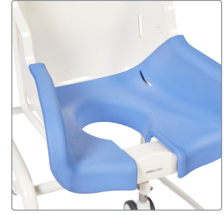
PU inlay, blue, for seat 870xx-61