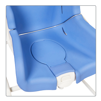
Seat infill, blue 8707x-61