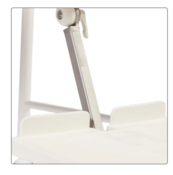
Rod for foot support