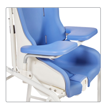
Swing-away armrest / tray 87013x-61