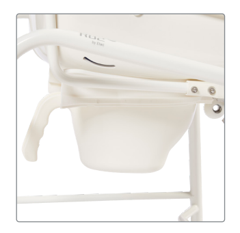
Commode pan 87080x