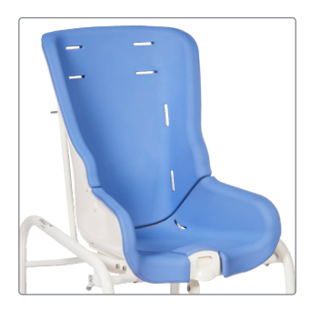
PU inlay, blue, complete