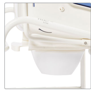
Potty ring 87080x