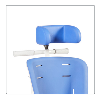
Push handle one size - 880110