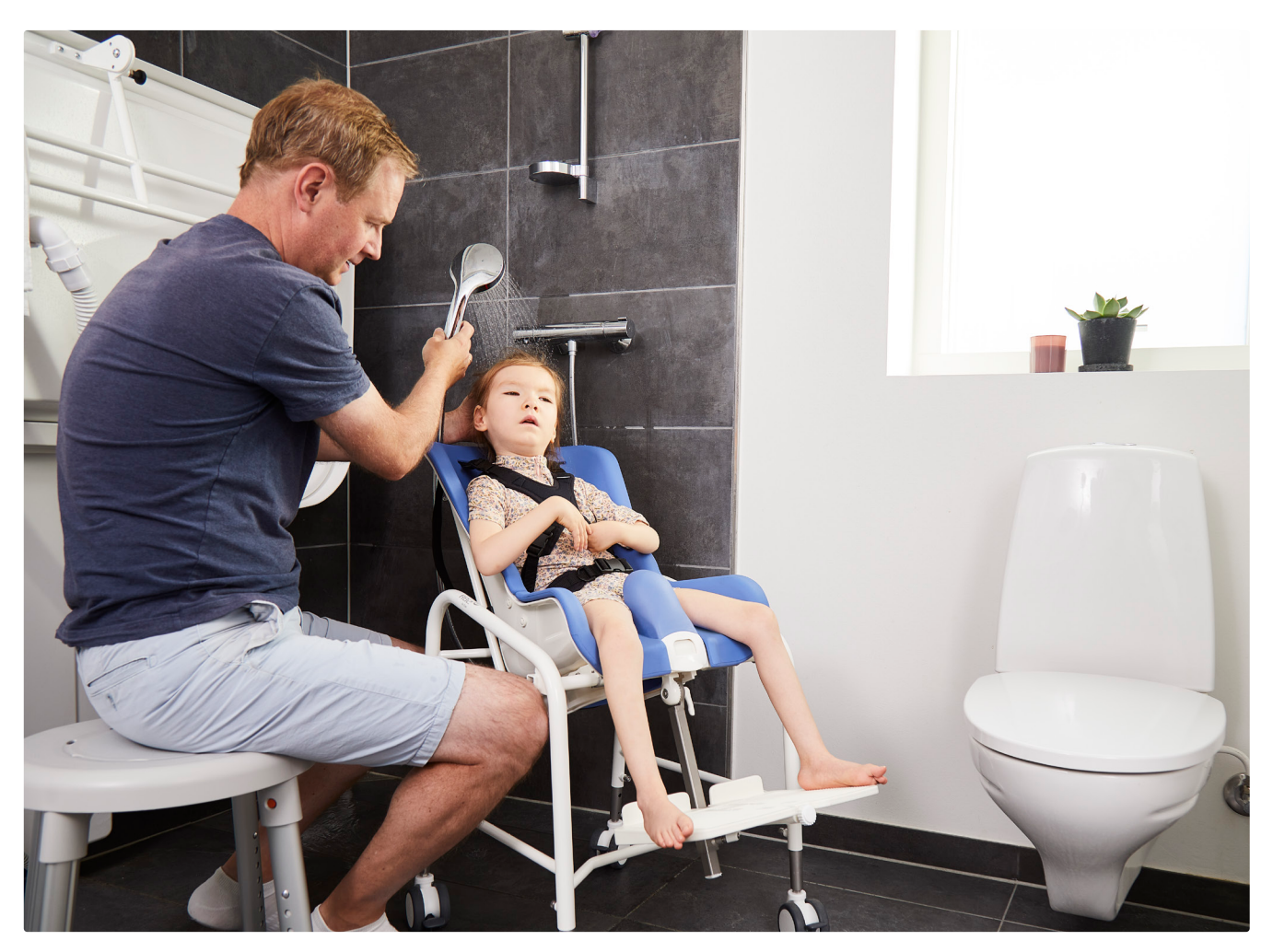
Read the full case story