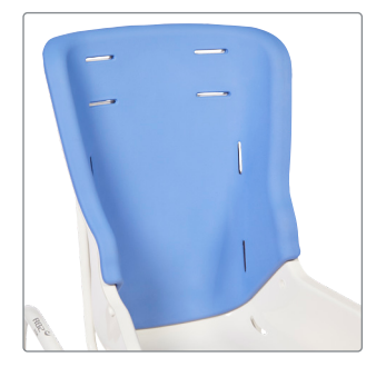
PU inlay, blue, for back