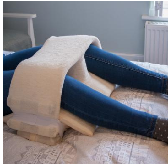
The Simple Stabilizer