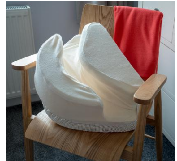
The Side Lying Leg Support

Each offers a unique and clinically effective position to protect the joints and soft tissues, but more importantly, they are super comfy!