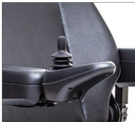
VR2 Joystick Controller