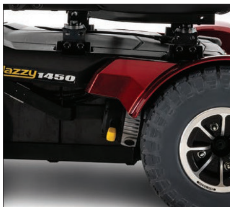
Regenerative and Electro-mechanical Braking System