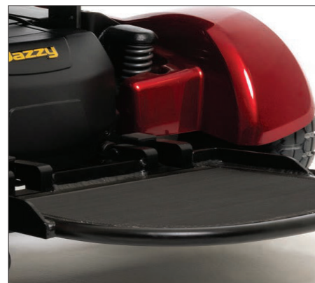
Fold-down Foot Platform