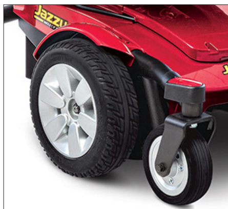
6" Castors Front & Rear For Stability