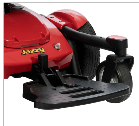
Height And Depth-Adjustable Foot Platform