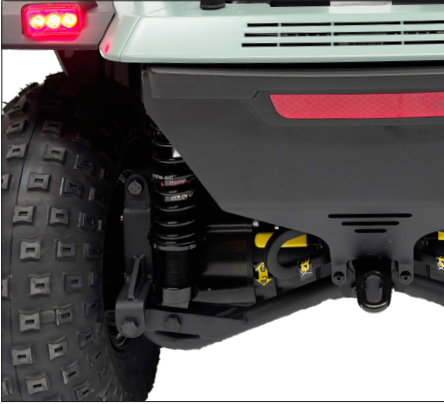
Automotive-Grade (SRS) Suspension