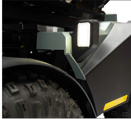
LED Lighting Package