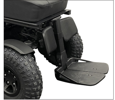
Centre Mount Foot Board (standard) or Swing Away Leg Rests (optional extra)