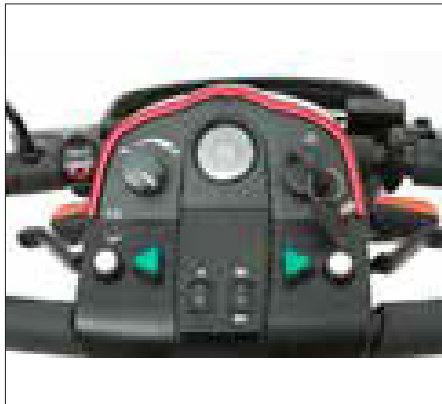
Easy Drive Tiller